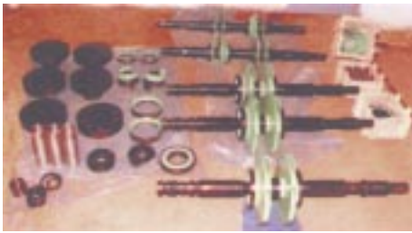
A range of pump spares

With a heavy fabrication/machining shop and a full-fledged electrical workshop and test facilities spanning over a combined shop floor area close to 2,00,000 sq. ft., Auto Parts possesses the capability to take on and execute the most challenging fabrication assignments, using a wide range of imported raw materials & infrastructure that conform to international standards :